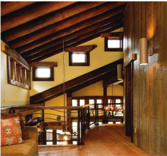
ABOVE Kitchen light fixtures from Lux Lighting in Portland illuminate hand-crafted cabinets made from re-sawn warehouse timbers. Terry and Teresa stumbled over the sink basin at Wood is Wonderful in Sheridan, Oregon while on a road trip looking for reclaimed wood. LEFT Clerestory windows creatively light the loft and living room below.

A set of salvaged bolts, washers and rods left over from the warehouse provided the raw materials for the iron railings that run along the stairwell and loft overhead. Together, Alex, Kelsey and Teresa helped create the design that playfully weaves together fish and stylized bubbles, an ode to the nearby ocean and its inhabitants.